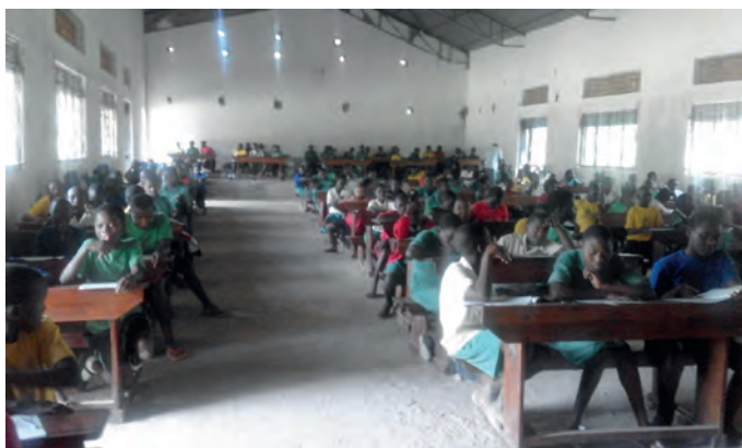
The hall being used for Joshua Primary School examinations. 2016.