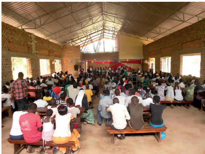
The hall being used for the Christmas Gathering. 2015.