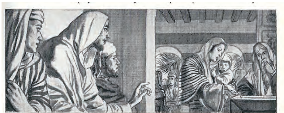
2. She threw into the chest two mites (which make a farthing). "You see," said Jesus, "that poor widow gave more to the treasury than all the others; for they threw in some of their abundance, but she, though in need herself, gave all that she had."